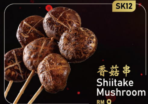
SK12 香菇串 Shiitake Mushroom RM 9