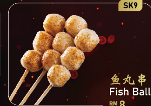
SK9 鱼丸串 Fish Ball RM 8