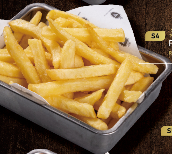
S4 薯条 French Fries RM 13