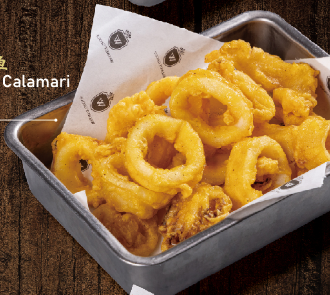
S3 烤酥炸鱿鱼 Crispy Fried Calamari RM 33