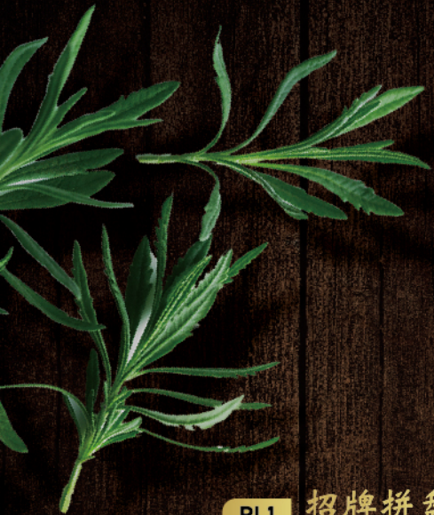
PL1 招牌拼盘 Signature Platter RM 128