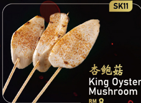
SK11 杏鲍菇 King Oyster Mushroom RM 8