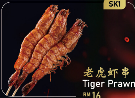
SK1 老虎虾串 Tiger Prawn RM 16