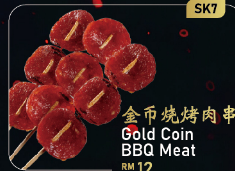
SK7 金币烧烤肉串 Gold Coin BBQ Meat RM 12