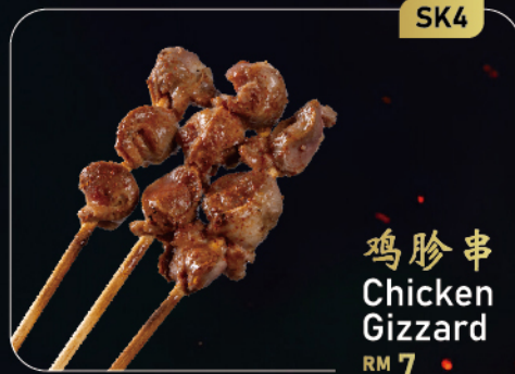
SK4 鸡胗串 Chicken Gizzard RM 7