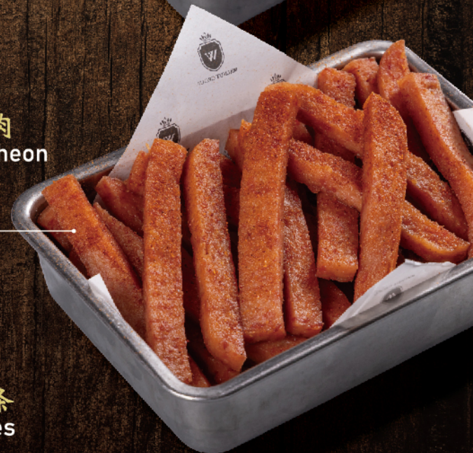
S5 脆皮午餐肉 Crispy Luncheon Meat Stick RM 20