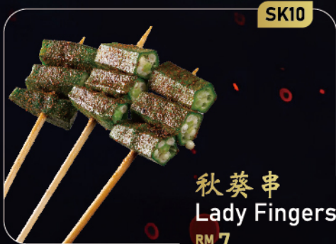
SK10 秋葵串 Lady Fingers RM 7