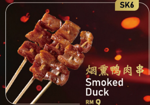
SK6 烟熏鸭肉串 Smoked Duck RM 9