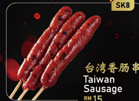
SK8 台湾香肠串 Taiwan Sausage RM 15