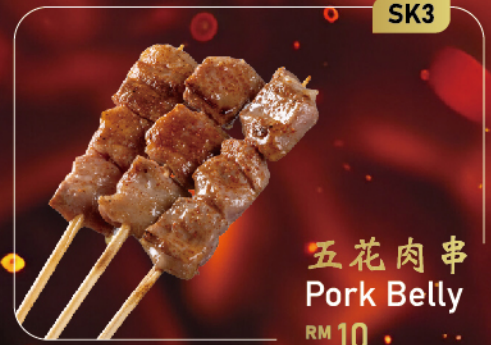
SK3 五花肉串 Pork Belly RM 10