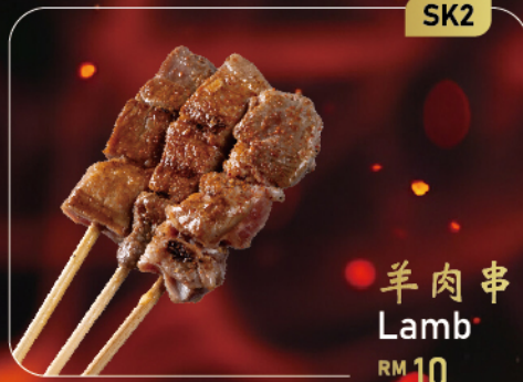
SK2 羊肉串 Lamb RM 10