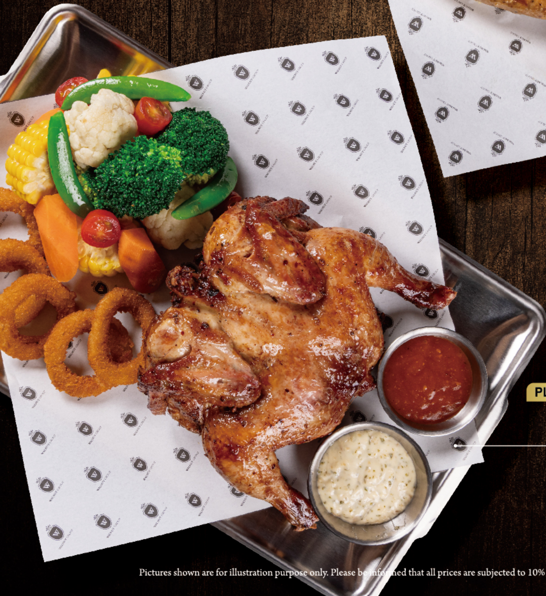
PL2 麻辣春鸡拼盘 Mala Spring Chicken RM 38