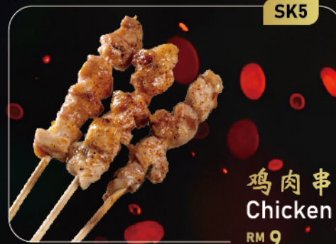
SK5 鸡肉串 Chicken RM 9